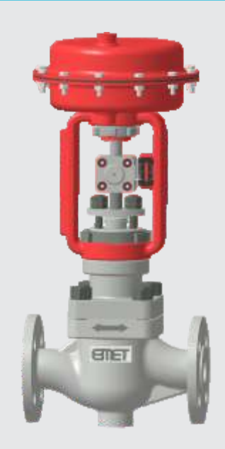
Series 10000/11000 & 15000