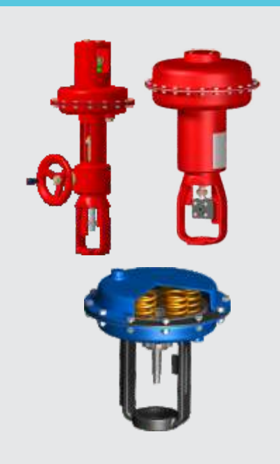
Multi-Spring / Single Spring