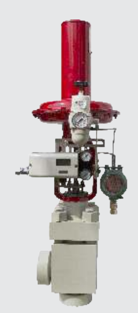
Series 12000/12100/12200 /12250/12260 & 15200