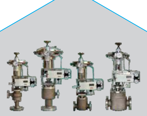
Special Forged Globe & Angle Control Valves Supplied To M/s.Hindustan Organic Chemical Limited